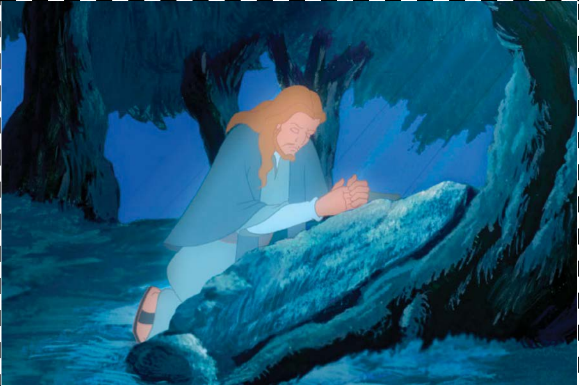
Jesus Christ atoned for our sins and He is our Savior.