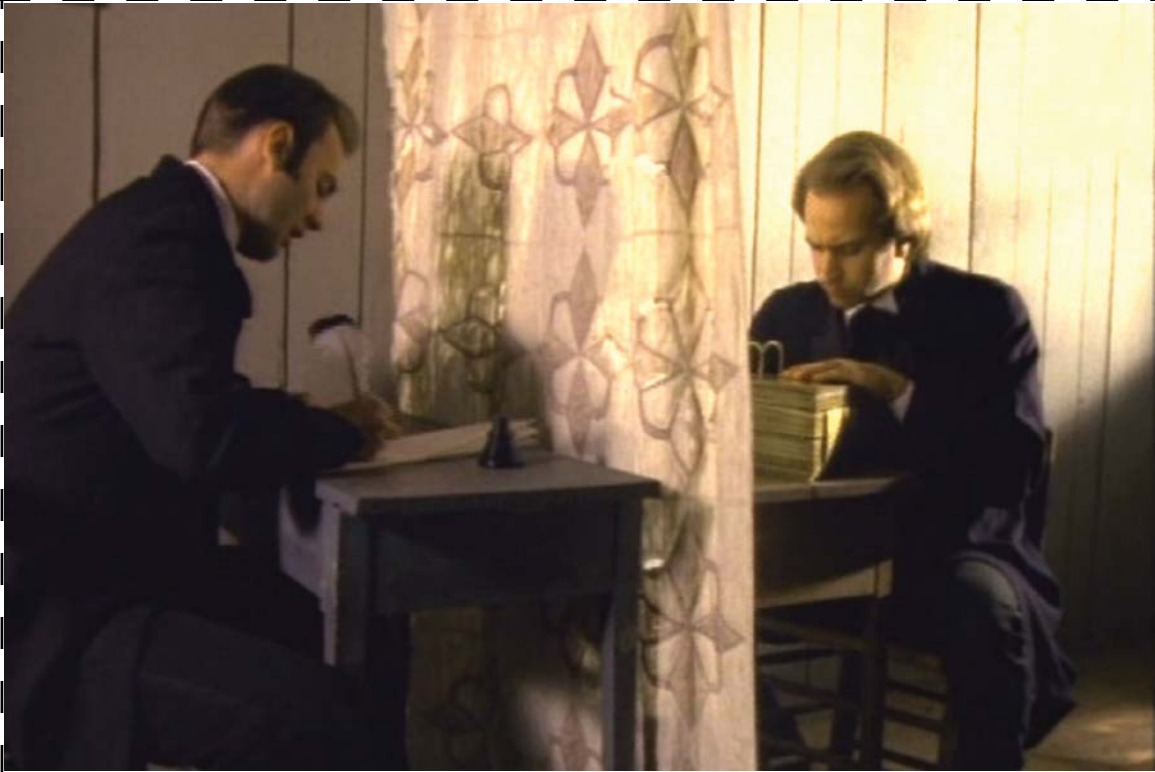
Joseph Smith translated The Book of Mormon