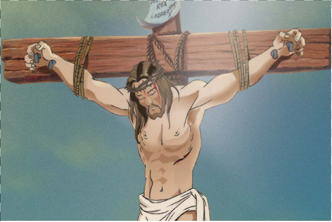
Jesus Christ died for us.