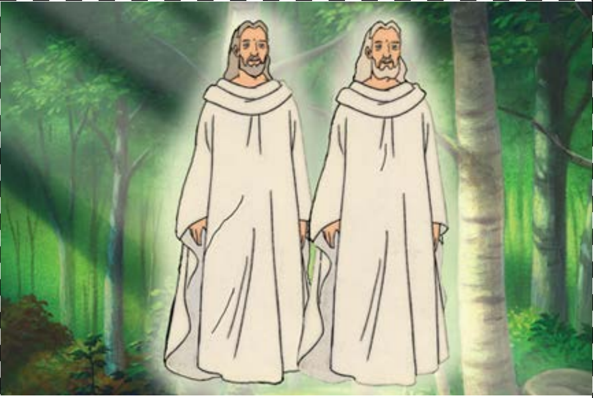
The Father and the Son live.