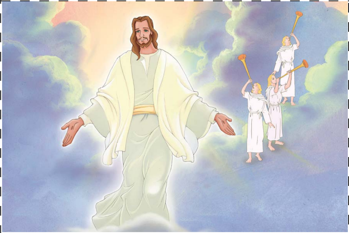
Jesus Christ will come again.