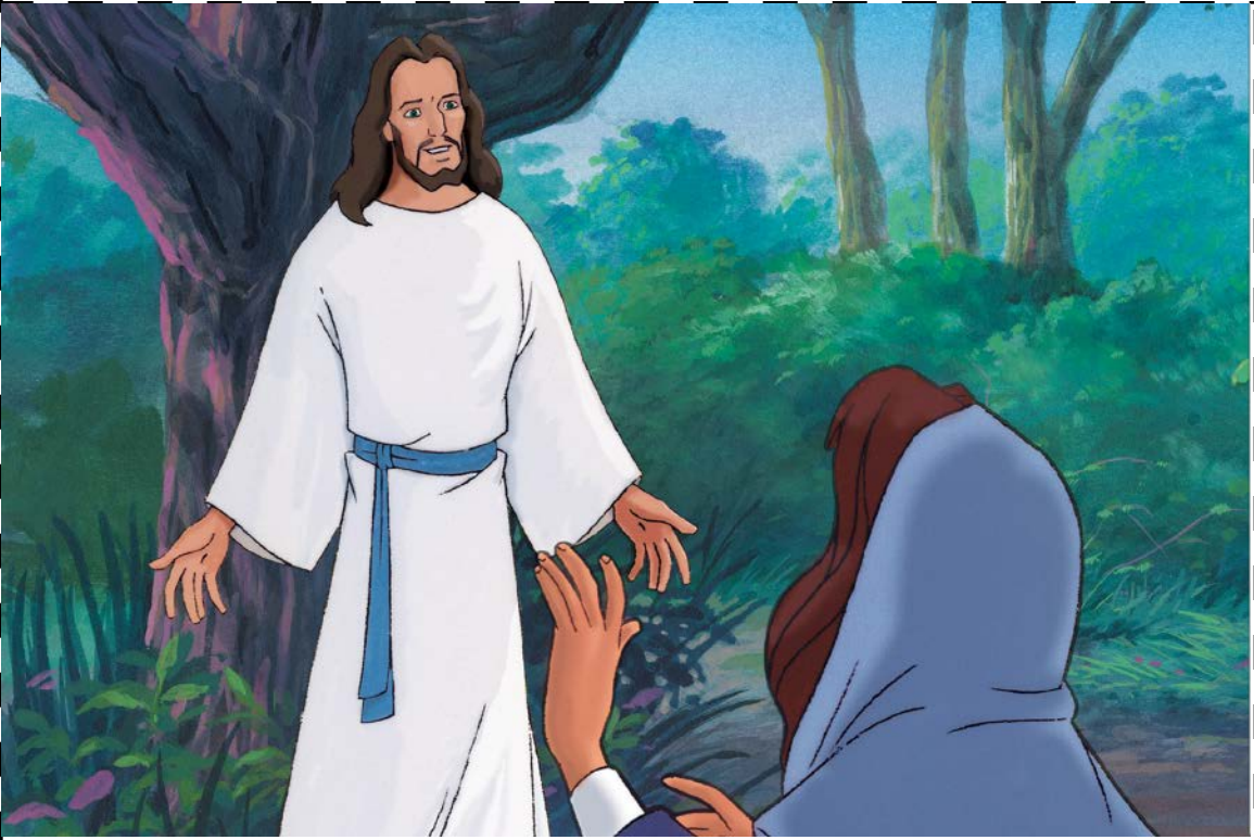
Jesus Christ was resurrected.